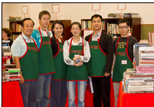
Georgia State Students at Bookfair