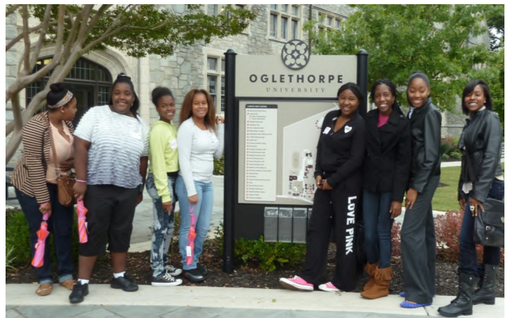
The cool scholars who attended the outing.