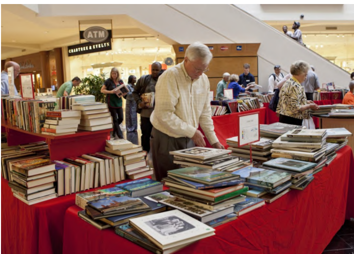
Patrons peruse the selection.

Many Atlanta Branch members donned the green-with-red-trim aprons at Perimeter Mall, where they were visible carrying books, bag-