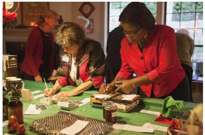
Holiday Party silent auction