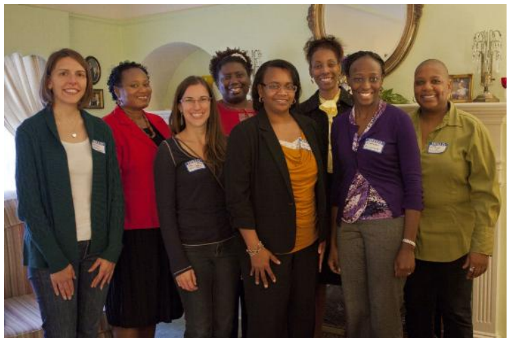
2012-2013 AAUW Funds recipients

Everyone left full of holiday spirit and excited about our upcoming activities for 2013.