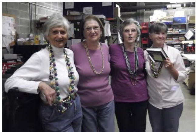
Bookroom Mardi Gras fun

New Orleans's Fat Tuesday has nothing over the Bookroom group who enjoyed a buffet lunch together on Tuesday, February 12th. Volunteering in the Bookroom is a great way to get to know not only members in the Atlanta AAUW branch but also the women involved from other branches. Please come in and help sort books, price a category, or pick up books for our sale!