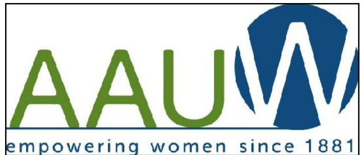
The new AAUW national logo

While most of the sections are reference resources, Branch Forums is an interactive area designed to permit members to communicate to and interact in a private venue. The secure location permits members to share information that is important to the entire branch overcoming e-mail communication drawback of involving only the individuals on the cc: list. Everyone gets to see reactions, responses, viewpoints and