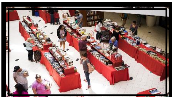
The 2014 AAUW Bookfair at Perimeter Mall

Many thanks to all of the volunteers who made the 2014 Bookfair a success! Bookfair is the primary source of our philanthropic funds, and we are pleased to have completed another great year. Bookfair is also an excellent opportunity to reach out to the metro-Atlanta community to share our mission of advancing equity for women and girls.