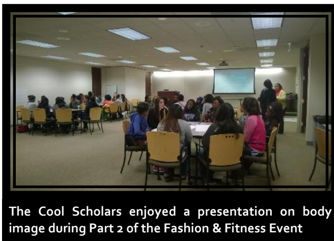
The Cool Scholars enjoyed a presentation on body image during Part 2 of the Fashion & Fitness Event

The Cool Scholars will volunteer at the McNair Discovery Learning Academy, located at McNair Discovery Learning Academy; (2162 Second Avenue, Decatur, GA 30032).