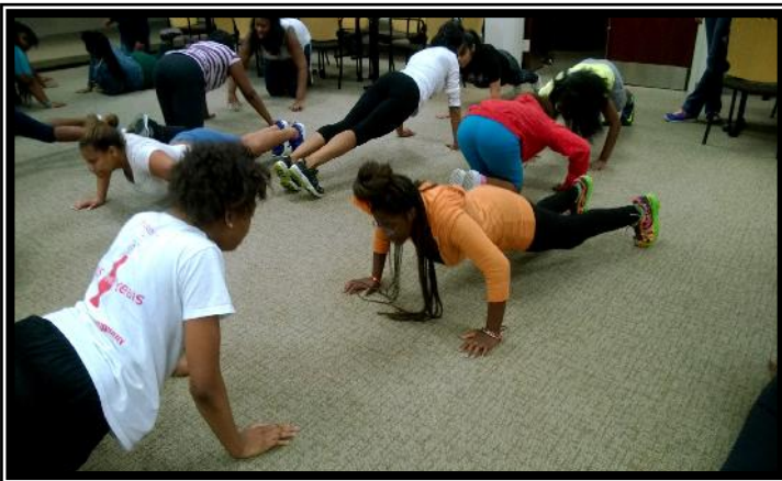
Cool Girls scholars participating in the Fitness & Fashion- Part 1 event on September 27, 2014

The Cool Girl scholars will discuss body image & the role of media in the shaping of body norms.