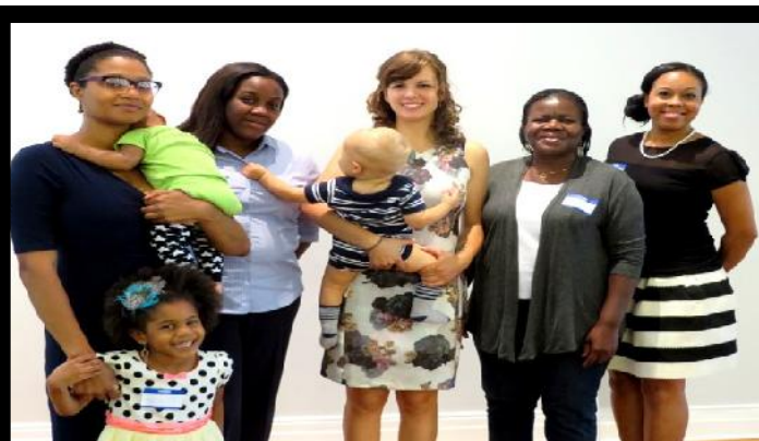
The Atlanta Branch 2014-2015 Scholarship Winners and their family members at the September Atlanta Branch meeting

The next Atlanta Branch meeting will take place on October 18, 2014.